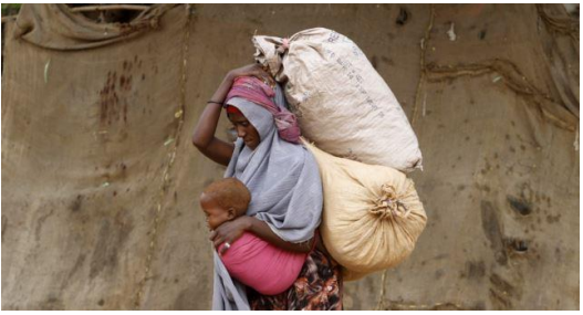
A displaced Somali woman carries a child and her belongings as she arrives at a temporary dwelling after fleeing famine in the Marka Lower Shebbele regions to the capital Mogadishu.