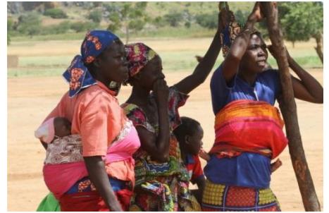
Women in the Mayo-Sava part of Cameroon say they are too frightened of potential Boko Haram attacks to farm