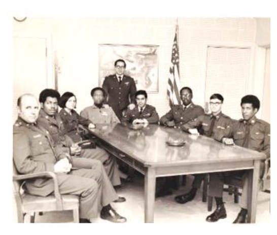
Westover Air Force Base, MA "Human Relation Committee"

By 1968, however, events in the military were moving much beyond the careful control of the Secretary's office. While the military was attempting to take the institution beyond society, blacks in the military were reflecting that society. Rioting blacks demonstrated frustration with institutional racism, powerlessness, and the war in Vietnam. Rioting became almost a trademark of many American cities during the 1960s. Institutional racism and powerlessness existed in the military but personal racism also existed in daily contacts between whites and blacks. As a result, racial incidents occurred at Longbinh outside Saigon (1968) and at Camranh Bay (1969) in Vietnam, and at Fort Bragg, North Carolina (1968), Camp Lejeune, North Carolina (1969).and Camp Pendleton. California (1970).