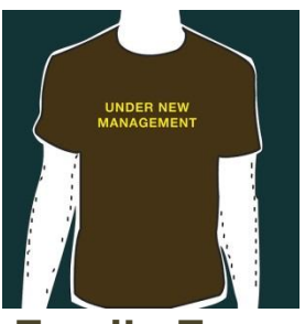
Family Farm Leadership Development